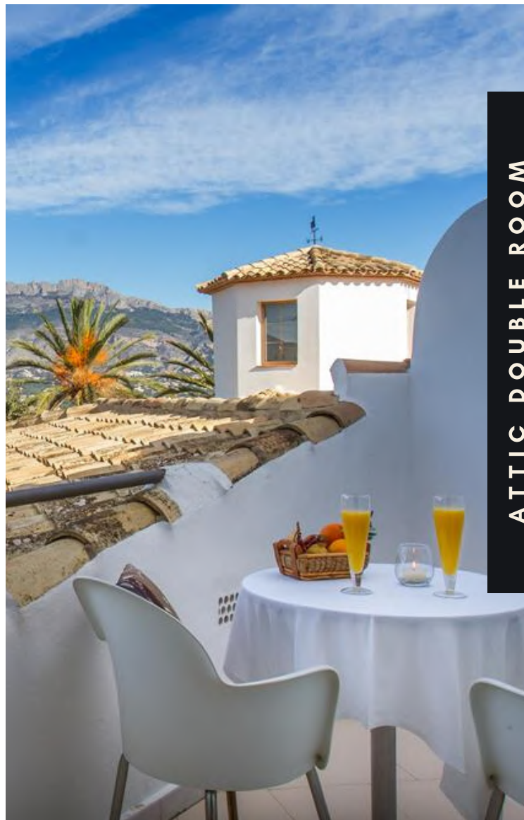
ATTIC DOUBLE ROOM WITH TERRACE/BALCONY