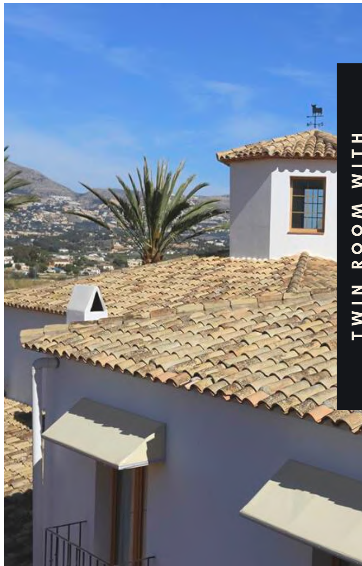
TWIN ROOM WITH BALCONY